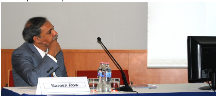
Moderating a Free Paper Session.