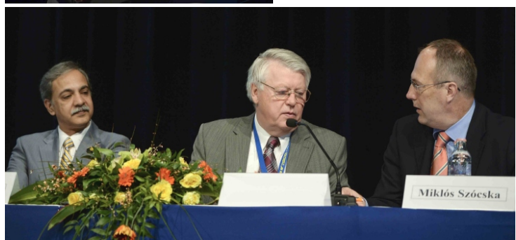
Development & Expansion of DS in the world: Lecture and Moderation.