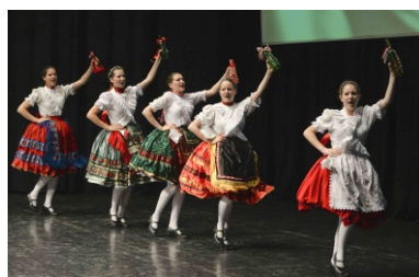
Hungarian folk dance.

Budapest, was a beautiful setting for a conference, apart from 800 participants from all over the world who shared their views on Ambulatory surgery, we were treated to a colourful traditional dances and music of the region. These, I share with you, pictorially.