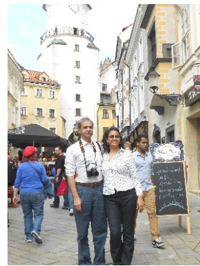
Sight seeing in Vienna & Bratislav