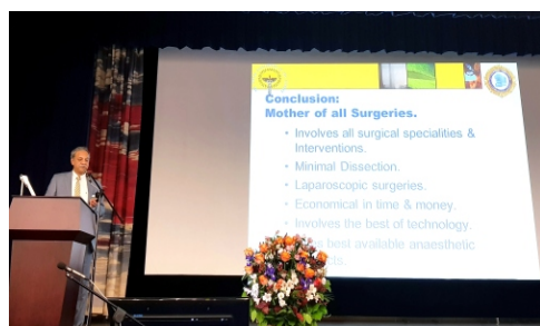
First lecture on Day Care Surgery in Russia