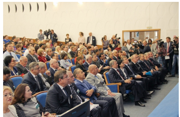
An International gathering, apart from BRICS nationals, there were delegates and lectures from, US, Belgium, Austria, Germany, Switzerland and Greece.

Correspondence: One Day Surgery Center-Babulnath Hospital, 15, Sadguru sadan, Opp. Babulnath Mandir, Mumbai-400 007