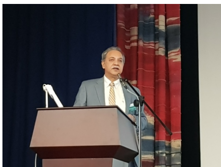
Day Surgery in Oncology: Indian Experiences