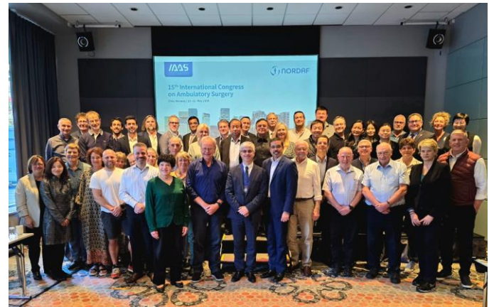
GA Members, 44 in all! And growing!

Correspondence: One Day Surgery Center-Babulnath Hospital, 15, Sadguru sadan, Opp. Babulnath Mandir, Mumbai-400 007