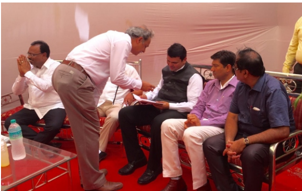
Dr. Naresh Row explaining Day Surgery Concept to CM, with other dignitaries looking on.

was graced by many dignitaries. Shri Devendra Fadnavis, Chief Minister of Maharashtra, and Shri. Nihal Chand, Central Minister, were among several, including MLA, Guardian Minister and Mayor of Nagpur.