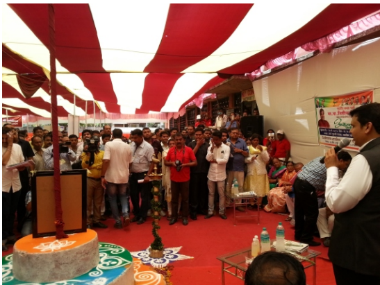
CM addressing the Camp.