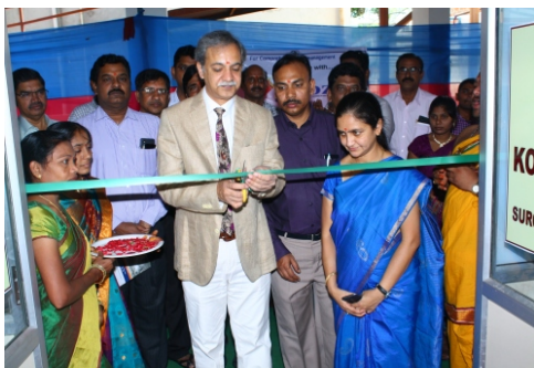
Inaugurating 'Koorapati Day Care Surgery Center'.