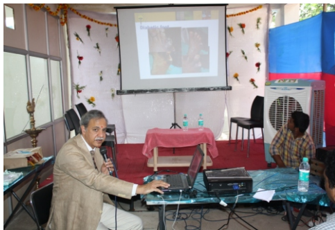
CME: Lecture on 'Day Surgery: a Concept'