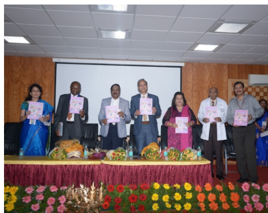
Release of the 12th Issue of the Day Surgery Journal of India