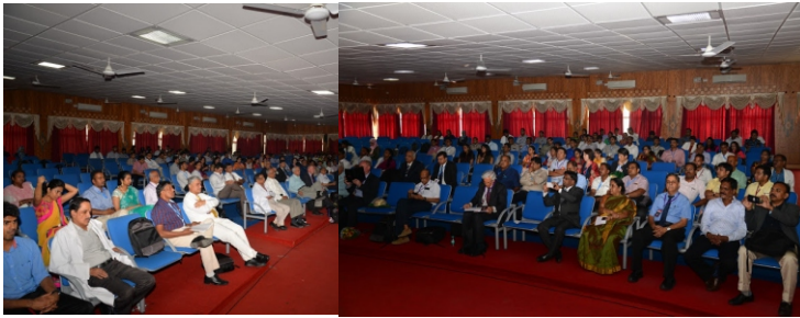
National and Inter National Delegates