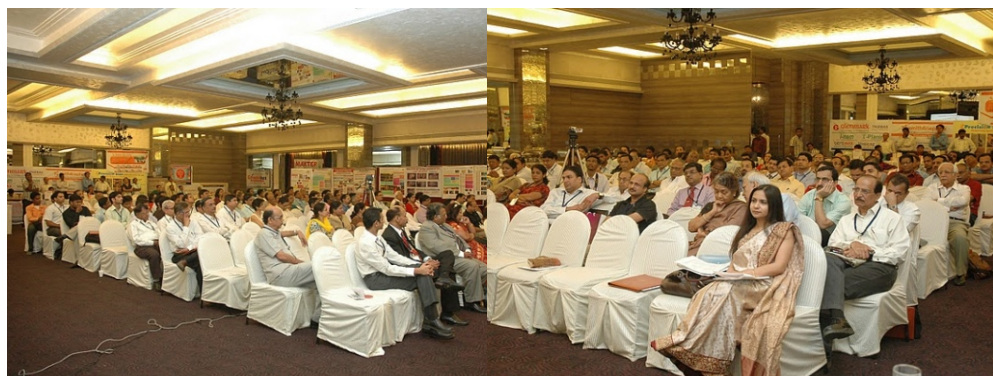
During Inaugural function