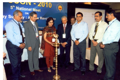
Lighting of the Lamp