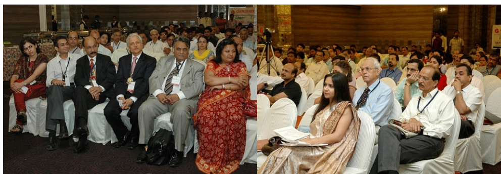
During the Oration