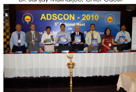
Day Surgery Journal of India being released.